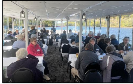
Cruisin' Down the River