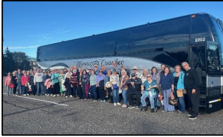
Our Royal Coach

Fifty-three adventurous seniors enjoyed an afternoon cruise on the St Croix River and a stop at an apple orchard on Saturday, October 12. We experienced a beautiful day full of fun – food and fellowship. Watch for another bus tour next spring and a fall trip to Branson for the National Senior Adult Conference – September 20 – 25, 2026.