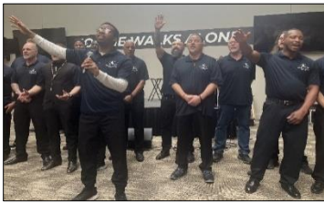
MN Adult & Teen Challenge men were our waiters and sang for us