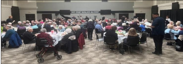
A large crowd of seniors joined us for our spring luncheon

A Note from the Director – The short / dark days of winter are receding, giving us opportunity to enjoy the summer season activities. Be sure to keep active! We enjoyed our annual spring luncheon on April 12 at Cedar Valley Church in Bloomington. It was good to see so many of you again. Here are a few pictures from that event.